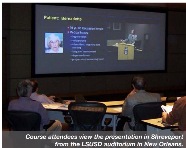
Course attendees view the presentation in Shreveport from the LSUSD auditorium in New Orleans.

For the first time in the 40-year history of continuing education at LSUSD, a course was transmitted live and electronically from Shreveport to New Orleans. The history-making class originated from a classroom on the campus of LSU Health Sciences Center in Shreveport and was sent